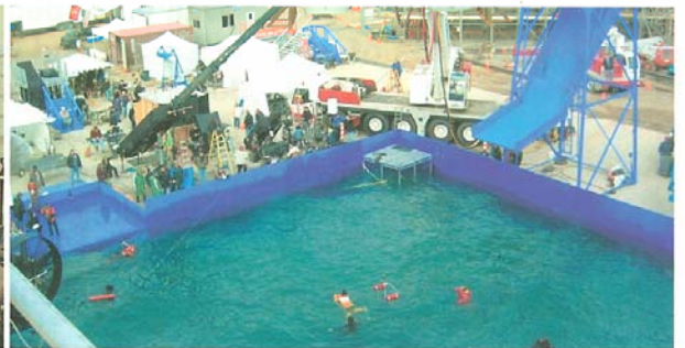
View from above as crew prepares to shoot a scene in "The Guardian."